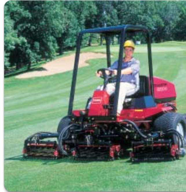
The new powered rear roller brushes for Toro's Reelmaster® mowers promote consistent grass dispersal, leaving fairways groomed with one pass.