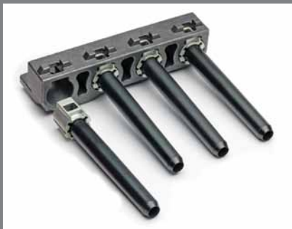
TITAN® QuickChange™ Tine Heads allow for faster tine change-out and reduce setup time.