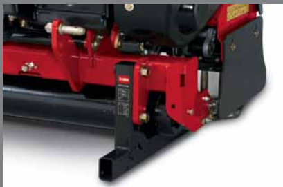
Custom stands make storage and setup fast, safe and convenient.