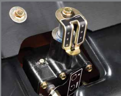
A high gear ratio makes depth control simple and precise.