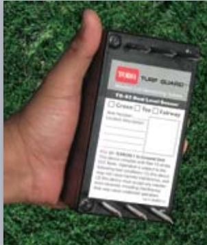
Wireless Sensor Measures Moisture, Temperature and Salinity Levels