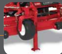
COOL-TOPS™ DOWNDRAFT SYSTEM