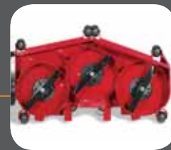
E-Z VAC SOFT BAG COLLECTION SYSTEM