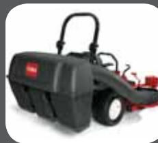
E-Z VAC DFS COLLECTION SYSTEM