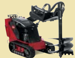
Auger Power Head (up to 24")