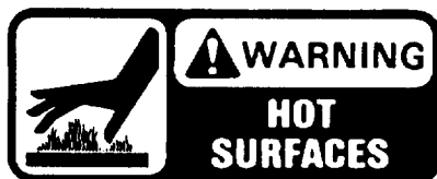
ON ENGINE (Part No. 66-6840)