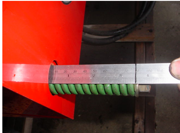
Figure 5 – Spring Length 8.9 cm (3.5")