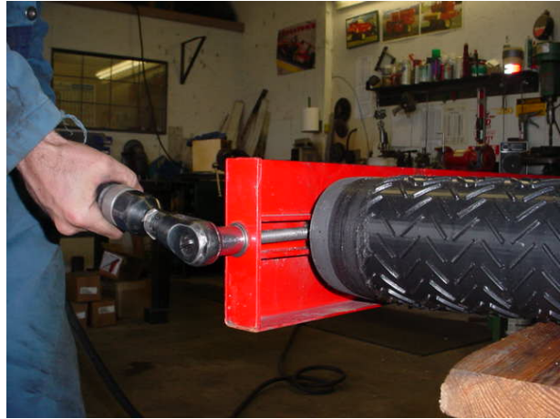
Figure 2 – Remove Tensioner Rods