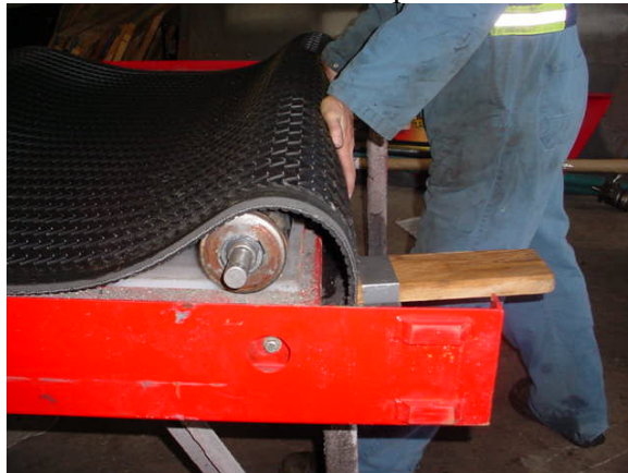
Figure 3 – Remove Idler Roller