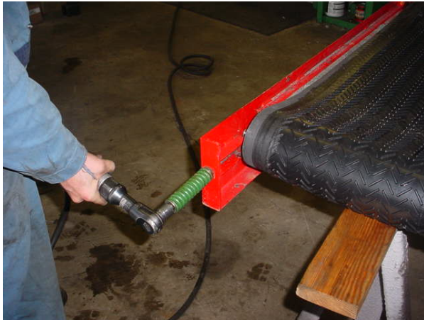
Figure 4 – Apply Spring Tension

NOTE: REPLACE existing spacers with new spacers provided in kit.