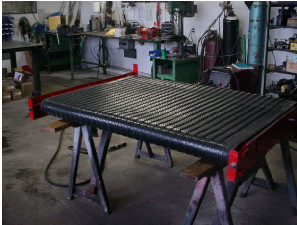
Figure 1 – Cartridge Assembly Removed